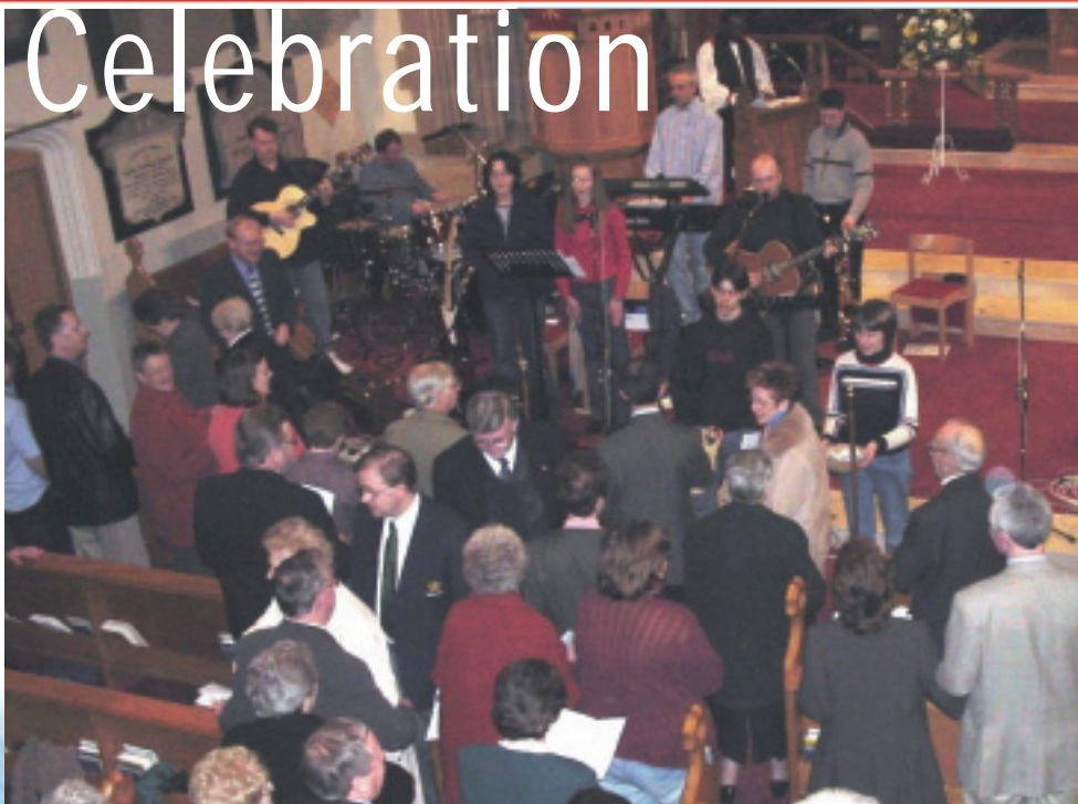
The congregation brings its offering 'African' style