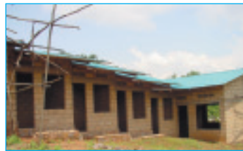
Construction of Kibungo Diocesan Training Centre