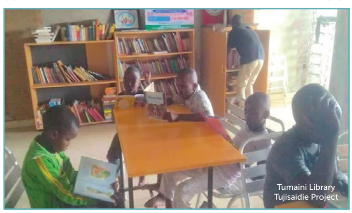
Fr 24. Please pray for a promised gift of 10,000 books to be donated to Tumaini African Foundation by an English charity. The books are scheduled to arrive in July and there are several hurdles to be cleared between now and then.