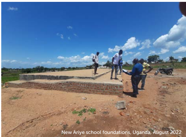
New Ariye school foundations, Uganda, August 2022