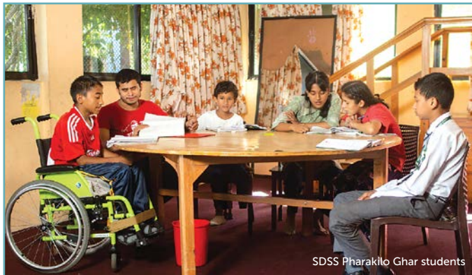
SDSS Pharakilo Ghar students