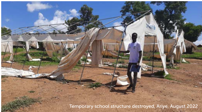
Temporary school structure destroyed, Ariye, August 2022

Su 18. As the final candle of prayer and penance is lit today, we pray for peace. Many of our global partners experience unrest and violence on a daily basis – we pray especially for those in situations of conflict around the world, that God may bring peace on earth and good will toward all.