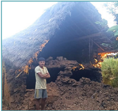
Image: Rukum Earthquake Damaged home